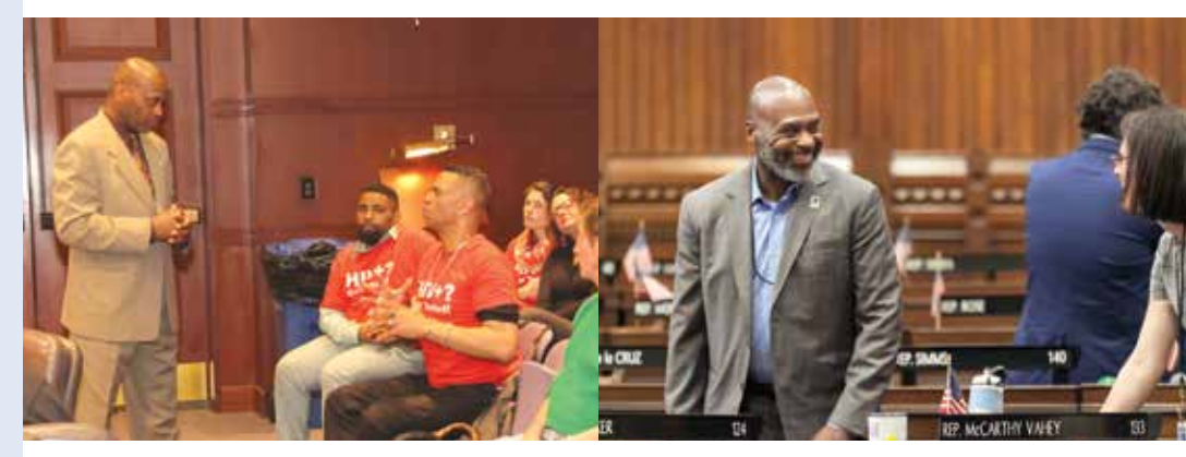
Rep. Baker with constituents in the Legislative Office Building

We have cleared the path for offshore wind energy generation so Connecticut can become a leader in green energy technology and help achieve the state's renewable energy goals. We anticipate a positive economic impact with the creation of good-paying jobs and economic development in New London, New Haven and Bridgeport. Under this bill, Connecticut will procure up to 2,000 megawatts of offshore wind power. This will help achieve our goal of 40% renewable energy by 2030. It also includes provisions to protect and minimize impacts on the environment and fisheries. (HB 7156 / Public Act 19-71)