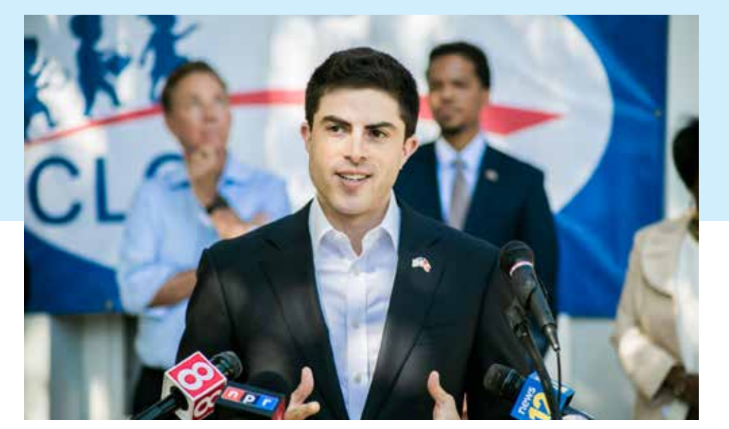
Matt Blumenthal State Representative

Legislative Office Building, Hartford, CT 06106-1591 Capitol: 860-240-8500 | 800-842-8267 www.housedems.ct.gov/Blumenthal Matt.Blumenthal@cga.ct.gov