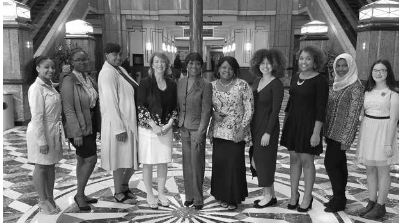
Students from West Haven High School visiting the Legislative Office Building

The Women’s Business Development Council provides entrepreneurial training and financial education programs. For more information, please visit www.ctwbdc.org , or email info@ctwbdc.org .