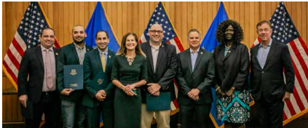
Governor Lamont signed VA Committee HB-5592 into law