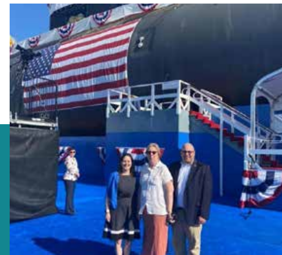
Representing the Connecticut General Assembly at the christening of the USS Hyman G. Rickover, the most recent state of the art USN Virginia-class submarine