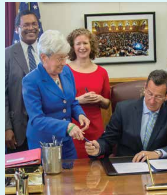
Bill Signing with Governor Malloy and Lieutenant Governor Wyman