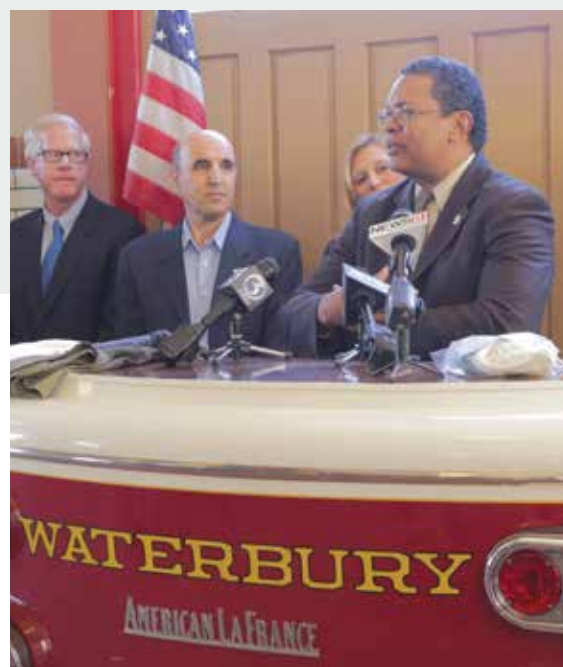
Addressing Waterbury Firefighters about previous legislation

Connecticut became the first state in the nation to create a Student Loan Bill of Rights, which establishes an Office of the Student Loan Ombudsman. This office will: regulate student loan servicers, compile data on borrower complaints, develop a financial literacy education course for students, and help student borrowers and their parents navigate the loan process.