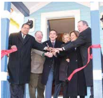
Ribbon Cutting Ceremony at Gaffney Apartments