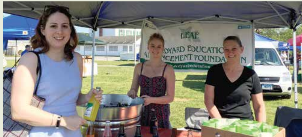
Ledyard Education Advancement Foundation (LEAF) raising funds for schools at the Ledyard Farmers Market

A new law expands the powers and duties of the Judicial Branch's Office of Victim Services (OVS). Among other changes, it creates a new process for victims seeking enforcement of financial restitution orders; makes more victims eligible for victim compensation from OVS by expanding injuries, crimes, and situations under which a victim may qualify for compensation, allows up to an additional $5,000 above the maximum $15,000 personal injury award for certain child-victims, allows OVS to waive consideration of available health insurance when determining victim compensation and expands court-ordered protections to certain victims of stalking. (PA 17-99)