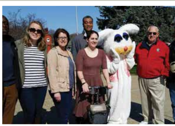
Groton's yearly Easter Egg Hunt