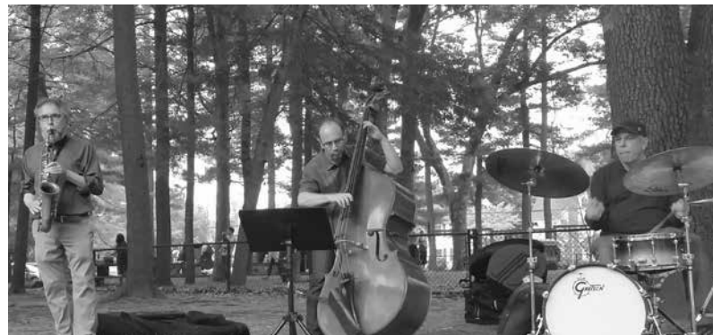
The WCA supports community events, including summer “Music in the Park” concerts, fundraisers, events at the Whitneyville Branch Library, and the Whitneyville Fall Festival.

Please consider attending one of their upcoming meetings on March 21st and May 16th at 7:00 pm at the Hamden Board of Education, 60 Putnam Avenue.