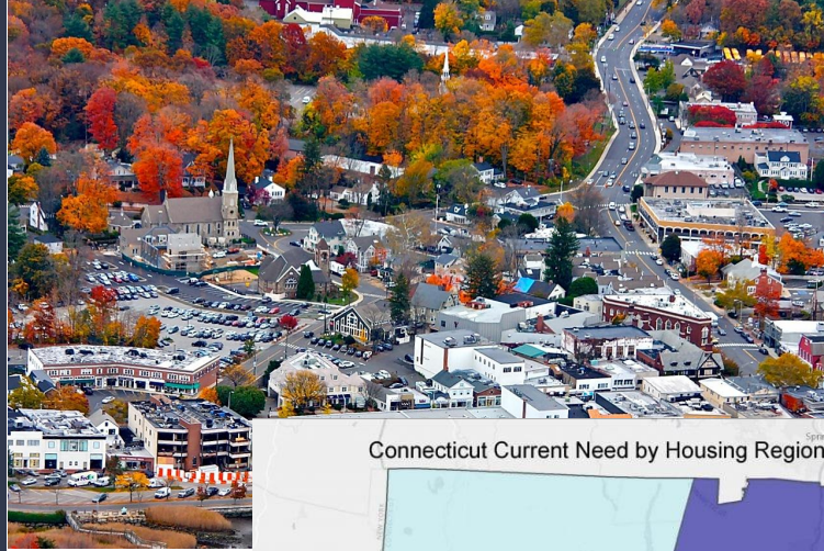
Connecticut Current Need by Housing Regions, 2020 (affordable housing units)