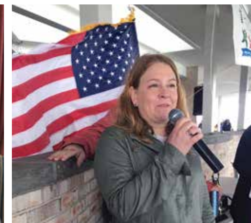
Meeting Norwalk Police Department officer and First Responder at the Capitol.