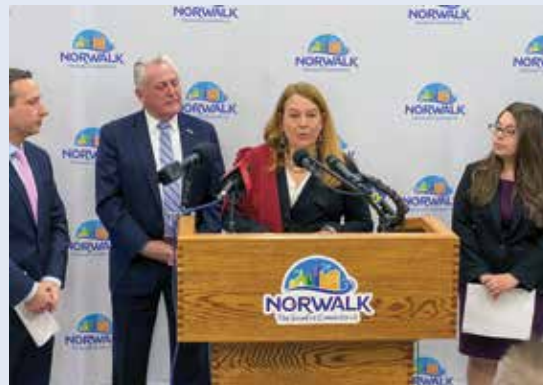
Speaking at a Press Conference about COVID on 3/5