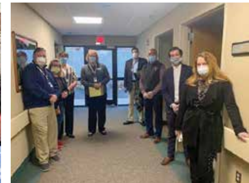
Touring Silver Hill Hospital, which is being used as a COVID step down unit