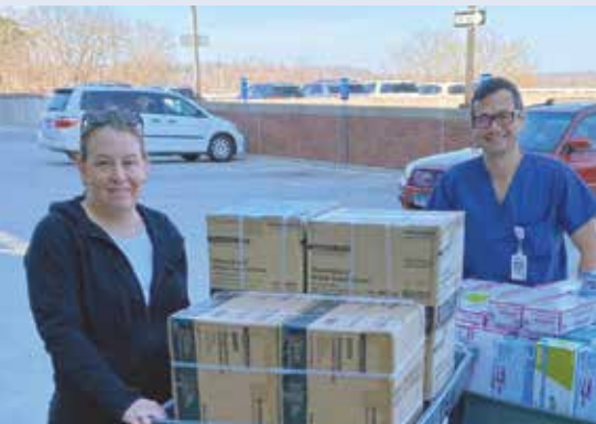
Delivering a donation of PPE to Norwalk Hospital on 3/26

Additionally, my colleagues and I have advocated for you with the Governor. I am proud to say that because of these efforts, we have expanded tele-medicine, brought additional COVID-19 testing sites to our community, opened a COVID-19 recovery center at Silver Hill Hospital, expanded affordable childcare options for front-line workers, and delayed due dates for state income and municipal property taxes. If there are more ways that we can make state government work better for you, please let me know.