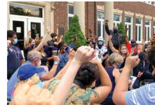
Attending a BLM peaceful demonstration