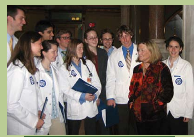
Medical students discuss health care with Rep. Dillon.