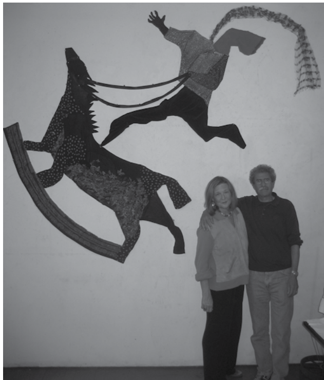
Open Studios at Erector Square

The Rell budget suspended a tax credit to restore our neighborhoods. Thanks to your activism, we discovered that almost half of those dollars go to New Haven zip codes. Losing that program would affect New Haven neighborhoods, and lose jobs. We restored the program.