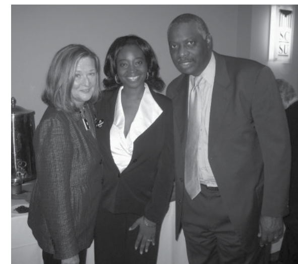
Memory Legacy Reception for Holocaust Memorial, SCSU