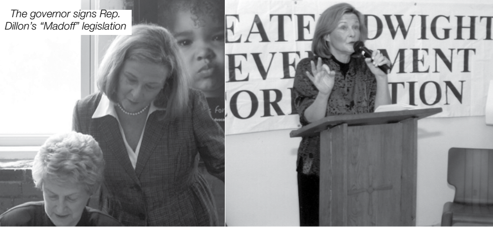
The governor signs Rep. Dillon's "Madoff" legislation

EXPANSION OF HISPANIC SERVICES, BIOSCIENCE LABS