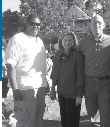
West River Peace Day