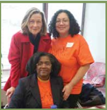
With Mothers for Justice at the capitol.