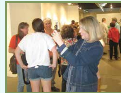
Taking photos of the artist at an artists' reception, Westville Village.