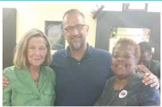
Barbershop, free back to school haircuts, upper Westville