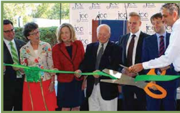
Jewish Community Center