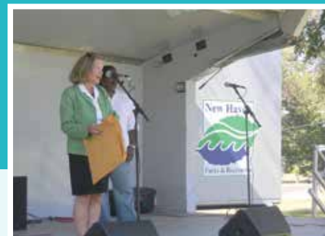
West River International Peace Day

The rising cost of transportation and housing squeezes food budgets for seniors. This year I tried, in HB 5734, to raise support for food vouchers. Instead we will explore alternate funding for senior nutrition. I will continue to press for affordable food for seniors.