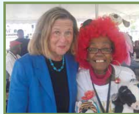
Clowning at Varick Family Day

Second Chance: Changes criminal law and aids re-entry by eliminating some minimum mandatory sentences and changing current 'justice by zip code' drug zones that treated offenders in urban areas more harshly. In addition School-Based Diversion, job training, and the Connecticut Collaboration on Reentry are funded.