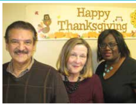
Thanksgiving at Casa Otoñal.