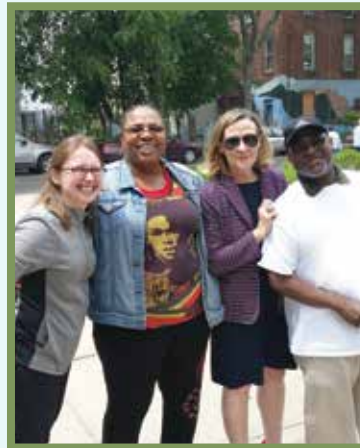
Dwight Neighborhood Spring Festival

In addition, we restored cuts to Westville Village Renaissance, Neighborhood Music School, Festival of Arts and Ideas, Long Wharf Theater, the Arts Council, and the Shubert Theater.