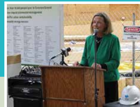
Common Ground ceremony