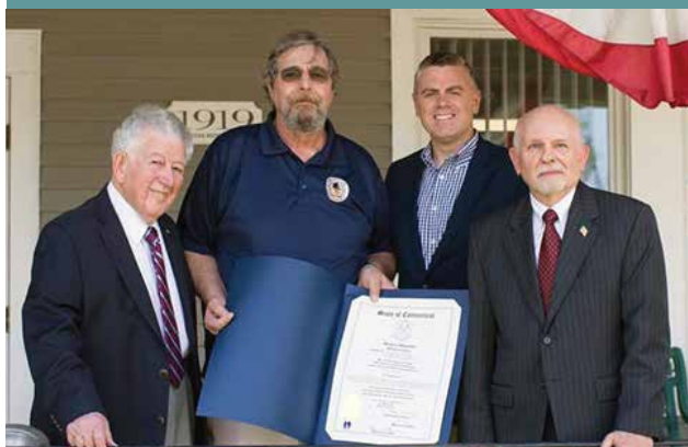
Rep. Doucette presenting the Army Navy Club a citation commemorating their 100th anniversary

MINORITY TEACHER RECRUITMENT AND RETENTION - We passed legislation which creates an annual hiring goal of 250 new minority teachers and administrators across the state. (SB 1022, PA 19-74)