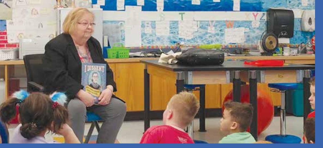
It was fun to read to students at South School in Windsor Locks!