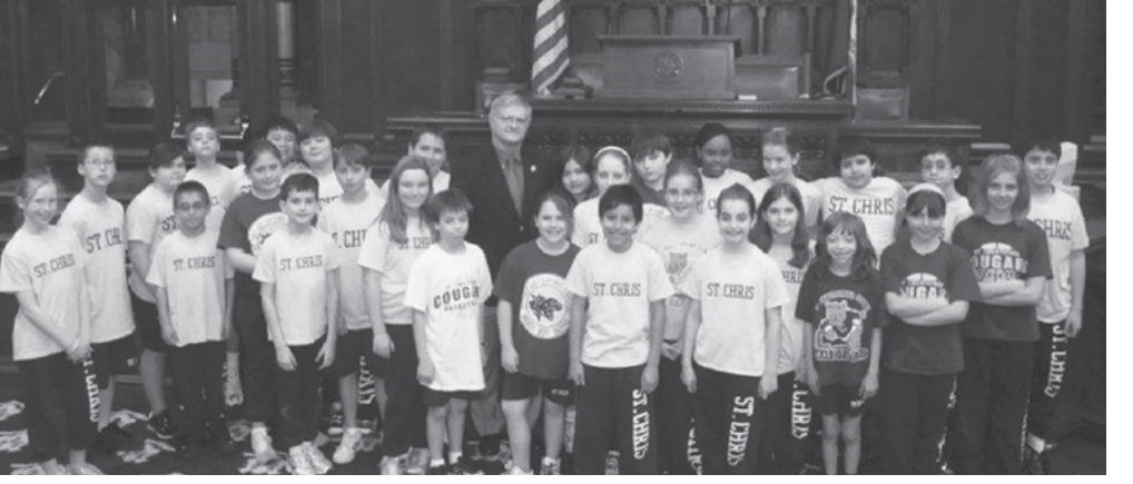
Rep. Genga with 4th grade school children in the House Chambe

In addition, better health care delivery will be attained for individuals and groups through a comprehensive plan that lays out a framework for a statewide health care delivery system that also leverages the state health plan pool to contain costs and promote preventive care.