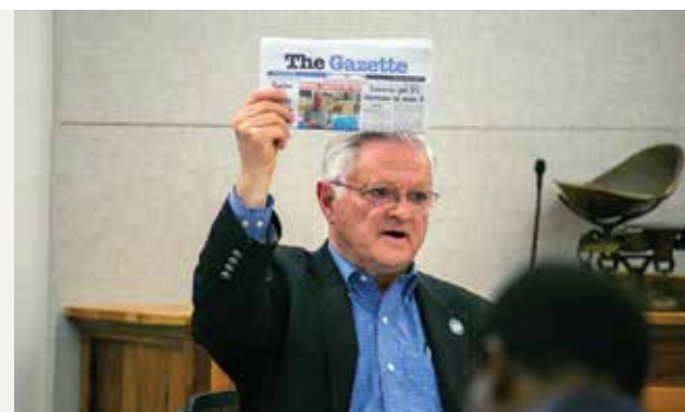
Rep. Genga speaks with residents about increased budget funding for East Hartford at a budget roundtable discussion.