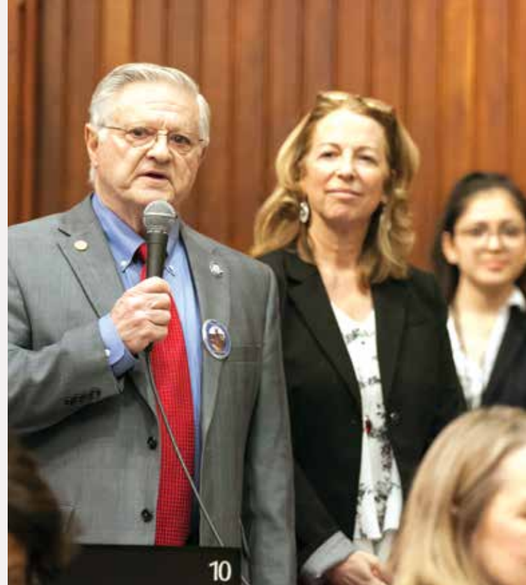
Representative Genga along with the Chair of the Committee on Veterans' Affairs, Representative Borer, introducing Veterans at the State Capitol.

Increasing Tax Exemption for Disabled Veterans: We increased the base property tax exemption for certain disabled service members and veterans by $500. By doing so, we also increased the additional income-based exemption for such service members and veterans, which is calculated using the base exemption, by $250 or $1,000, depending on their income.