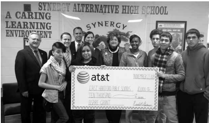
REP. GENGA SECURED $10,000 SCHOLARSHIP GRANT FOR SYNERGY GRADUATES