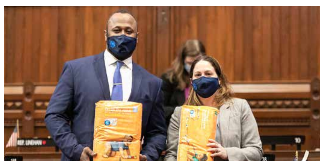
Rep. Gibson's annual diaper drive at the capitol