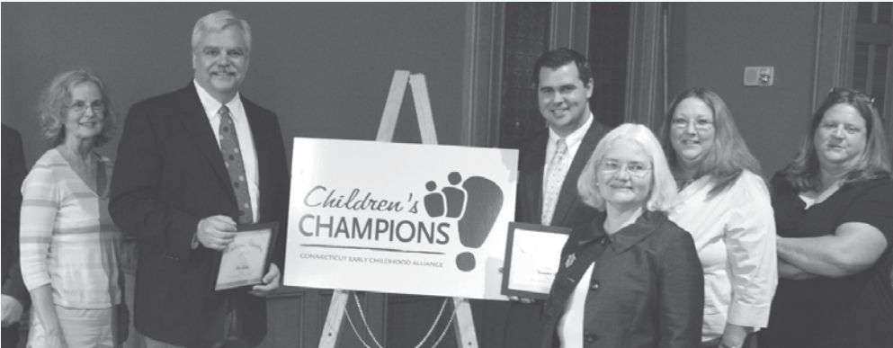
Reps. Godfrey and Lyddy receive the 2010 Children’s Champions Award for Western Connecticut at the State Capitol.

We passed a significant new jobs bill (PA10-75) that will help put Connecticut on the road to economic recovery with: » Up to $500,000 in loans and lines of credit for small businesses and nonprofits » Student loan reimbursement for careers in new and emerging fields » Income tax credits for investments in new technology businesses » Sales tax exemptions for machinery, supplies and fuel in renewable energy industries » Tax credits for small businesses of up to $200 per month per new employee » Up to $150,000 in pre-seed financing and technical services to businesses developing innovative concepts » A Community-Technical College advisory board to assess the training needs of unemployed residents. » Better environmental rules to speed up business permitting process