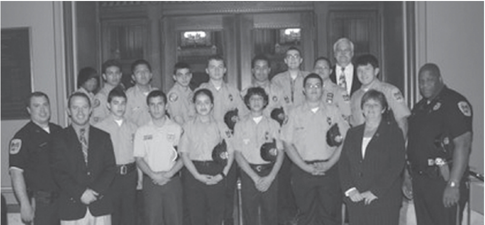
Danbury Police Explorers pose with Reps. Taborsak, Giegler, and Godfrey outside the House Chamber.

Cities and towns can now save taxpayers’ money by sharing health insurance plans (PA 10-174). » Two or more towns or boards of education can join together to purchase health care benefits at lower costs. A larger group size can achieve lower premiums, better benefits for employees and more bargaining power for towns » Municipalities can pay less for prescription drugs through state discounts. The bargaining power, low administrative costs, and volume discounts negotiated by the state will save cities and towns money