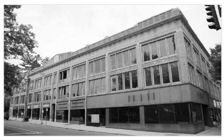
Future Downtown home of Naugatuck Valley Community College's Danbury Branch.