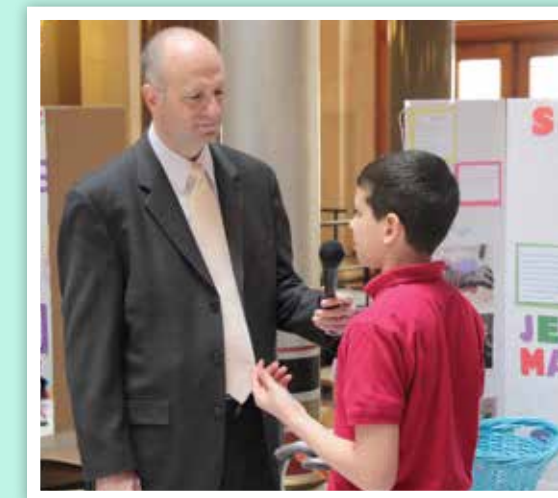
Rep. Haddad speaking with student inventors at the Connecticut Invention Convention's Day at the Capitol