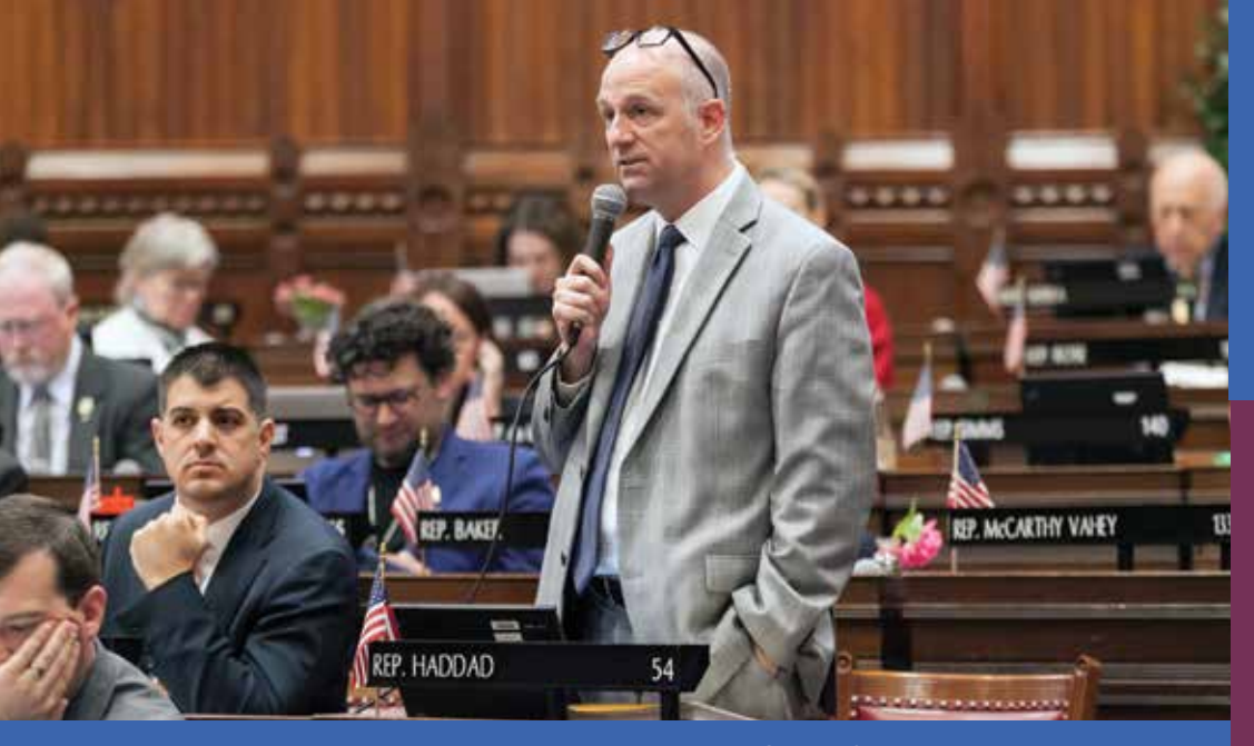
Debating a Higher Education bill on the floor of the House.