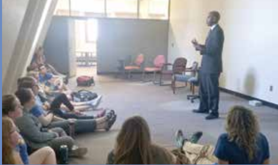
Rep. Hall speaking with students