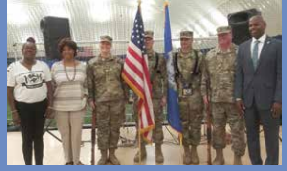
Standing with the Color Guard at the 46th Annual Invitational American Double-Dutch League World Championship