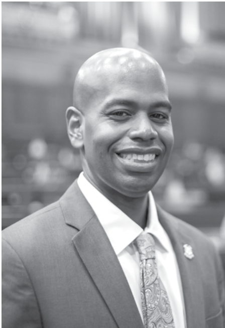
STATE REPRESENTATIVE JOSHUA HALL

Legislative Office Building, Hartford, CT 06106-1591 Phone: 860-240-8585 Email: Joshua.Hall@cga.ct.gov www.housedems.ct.gov/Hall www.facebook.com/RepHallCT