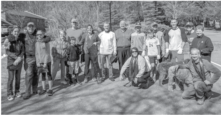
REP. HAMPTON WITH VOLUNTEERS FROM SIMSBURY LITTER LUGGING DAY IN APRIL 2018