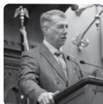
State Rep. Bill Heffernan

Stay up-to-date by signing up for my e-blasts online at housedems.ct.gov/Heffernan or scan the code with your phone