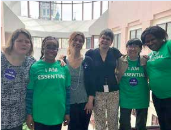
Standing in support with advocates from the ID/DD community

This session, we required more health insurance plans to cover pre-existing conditions. Prior to the Affordable Care Act, if someone had a pre-existing or chronic condition, insurance companies could refuse to insure them – impacting fifty million people. As a result, hospital emergency rooms and Medicaid were forced to absorb these costs, resulting in higher prices for everyone. Passed unanimously, this protects Connecticut residents against any changes to federal law.