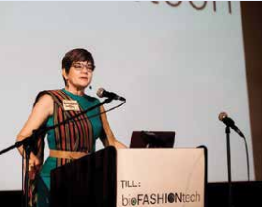
Rep. Hughes giving opening remarks at the Inaugural Annual bioFASHIONtech Summit

We have passed legislation which will provide workers’ compensation benefits for police officers, parole officers and firefighters suffering from PTSD due to events in the line of duty. Our first responders see violence and death on a too frequent basis and we must help them cope with the effects of these tragic experiences. The legislation also requires a study of the feasibility of expanding these benefits to include EMS and Department of Correction employees. We aim to include EMTs in next session’s legislation.