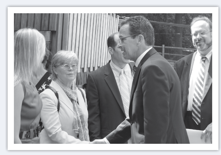
Rep. Johnson, Gov. Malloy and Education Commissioner Pryor celebrate the new Office of Early Childhood.