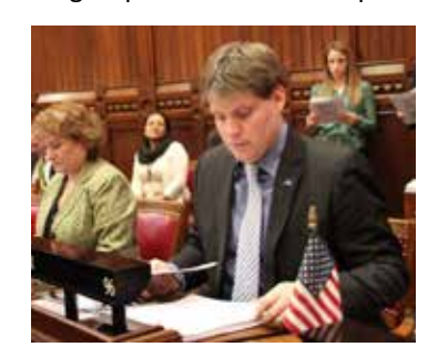
Rep. Lemar prepares for a floor debate to raise the minimum wage

The state cannot solve all problems, but thankfully we have many nonprofit and charitable groups in New Haven who help provide essential services. The state happily provides funding to such groups as it costs taxpayers less than if the state were to address such issues, but grants are competitive. I have fought for many nonprofits to get necessary funding to continue vital community programs from prison re-entry job training to expanding our farmers' markets. The New Haven Museum was awarded funding for a "New Haven Works" lecture series while the Young Men's Institute Library focused on amateur expert talks. The Clifford Beers clinic was able to replace their roof. Leeway expanded their range of services while Crossroads, Inc. and Marrakech, Inc. both got supplemental funding for generator replacement and other facility upgrades. These organizations are incredible assets to our community and I am happy to lend a hand when groups like these are requesting state funds.