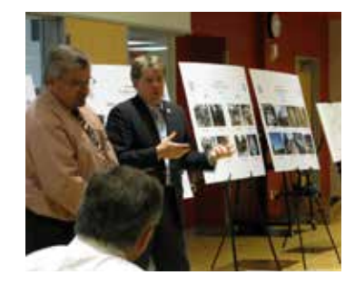
Rep. Lemar speaks at a public hearing on limiting the impact of new construction on local residents and businesses