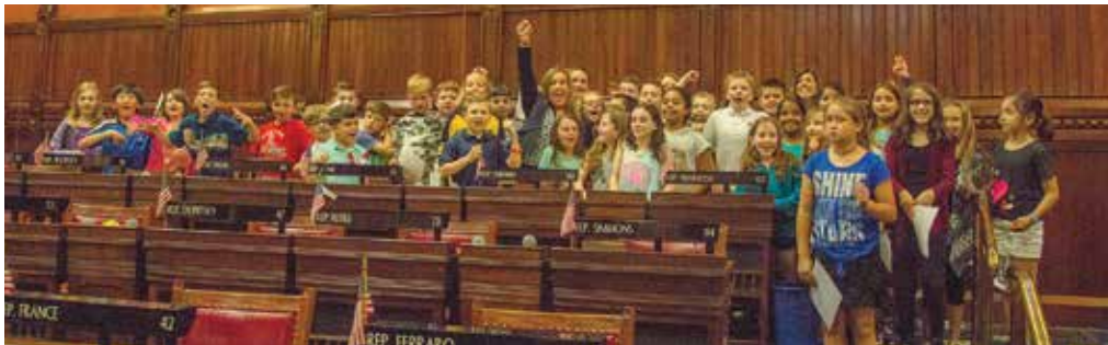
Rep. Linehan with Highland Elementary School students during their visit to the State Capitol and following a lesson on pay equity legislation that was passed in Connecticut this session.

Schools must be safe places to learn, so we increased funding for school security measures by $15 million - including $517,000 for our district . Our towns can use these resources for entrance upgrades, bullet-proof glass and security cameras. I will also continue to advocate for social-emotional learning programs in our schools as a way to combat school violence at the root of the problem.