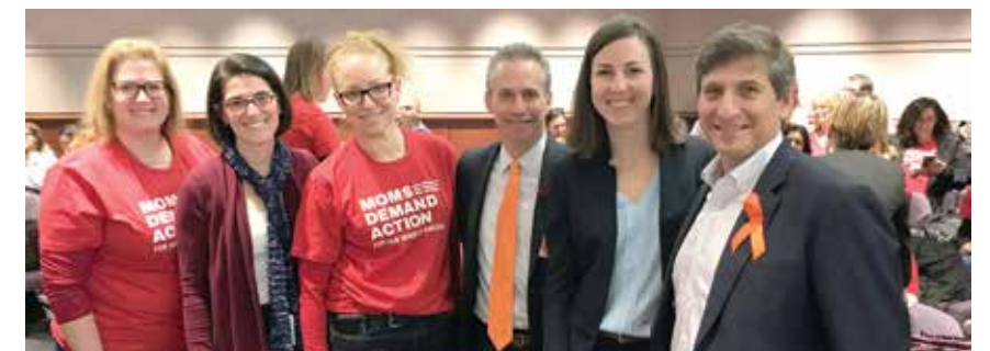
Fairfielders join Connecticut Against Gun Violence Leaders to Advocate for gun violence prevention

Recognizing that prescription drug prices are the number one driver of rising healthcare costs, we passed legislation to hold pharmaceutical companies accountable by increasing transparency and requiring them to explain large price increases for drugs that have a substantial cost to the state. Additionally, insurance companies must now submit information about which drugs are most frequently prescribed and which are provided at the greatest cost. By collecting more data and holding drug companies accountable, we can get closer to lowering drug costs for Connecticut residents.