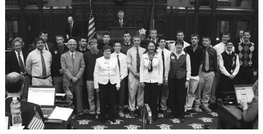
Sheenan High School Boys Basketball Team State Champions being honored in the House Chamber