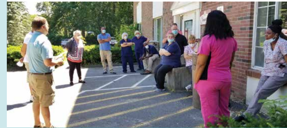
Listening to the incredible stories of 1199 frontline health care workers at Regal Care during the COVID-19 pandemic and discussing what I can do to help.

Your stories and experiences are important to helping us improve the quality of life for you. How well did the safety net work for you and your family? How can we do better? What services were not available that you really needed? I want to hear from you!