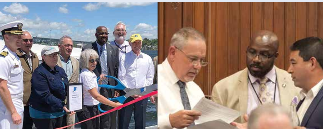
Ribbon cutting to kick off the 4th season of the Thames River Heritage Park Water Taxi

Foreclosures have affected many Connecticut homeowners from wealthy communities to inner cities. We are helping families stay in their homes by extending the state's Foreclosure Mediation Program for people facing tough times. The program requires mortgage lenders to use mediation to avoid foreclosures. Since the beginning of the program in 2008, it has helped nearly 30,000 homeowners reach settlements, allowing them to keep their homes.