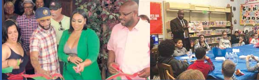
Ribbon cutting at the Grand Opening of The Green Room restaurant & bar