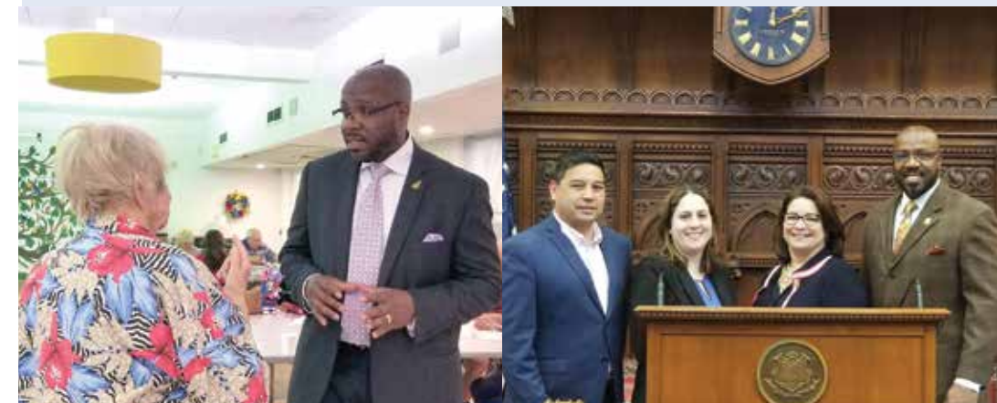
Speaking with a constituent at the New London Senior Center