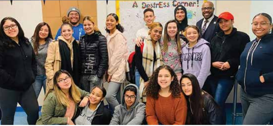
REP. NOLAN VISITING STUDENTS AT HIGHER EDGE.