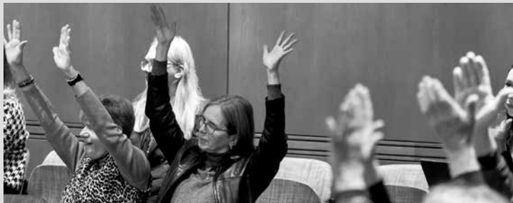
Press conference for the Deaf, Deafblind, and Hard of Hearing.