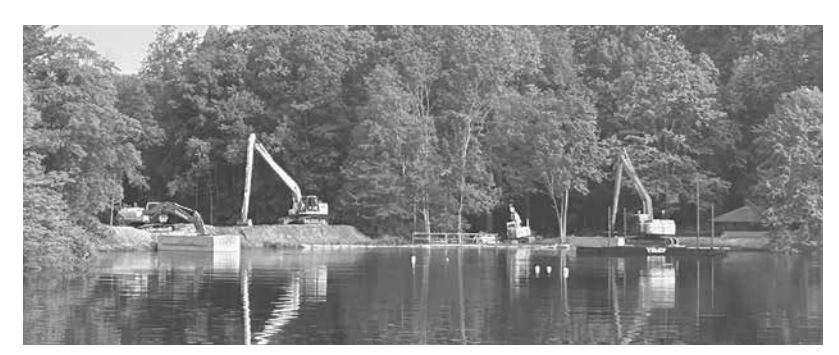
Representative Poulos secured a $500,000 DEEP grant to finish the dredging of Sloper Pond.