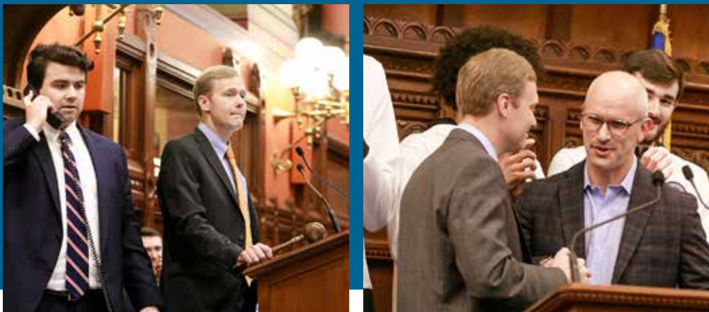
Left: Speaker Ritter presides over the House of Representatives as bills are passed on the final day of the legislative session.