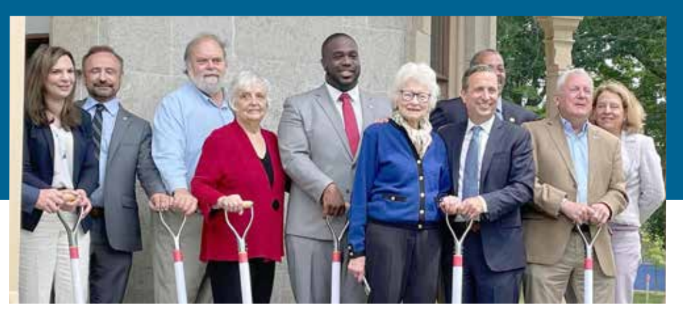
Above: Rep. Roberts and other dignitaries celebrate the ground breaking of a new educational facility at the Lockwood-Mathews Mansion Museum.