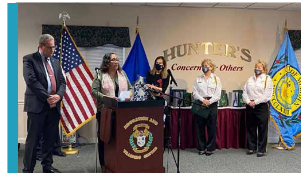
Rep Santiago discussing the importance of first responders and health care providers during the pandemic.