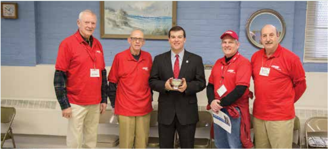
Receiving the AARP Legislative Achievement Award

I am very honored to have received the 2016 Bridgeport Regional Business Council Legislator of the Year Award, which recognized my work in this area.