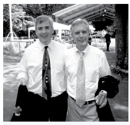
Rep. Tim O'Brien and Rep. Peter Tercyak at the Dozynki Polish Festival in New Britain

CONTACT PETER TERCYAK Legislative Office Building Room 4029 Hartford, CT 06106-1591 Capitol: 860.240.8500 Peter.Tercyak@cga.ct.gov www.housedems.ct.gov/Tercyak