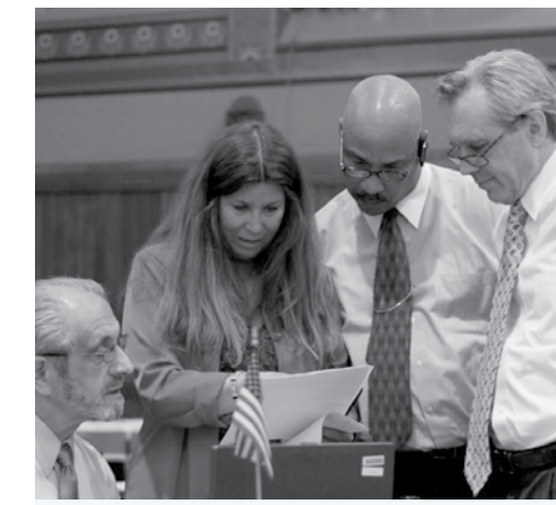
Rep. Peter Tercyak (right) with other representatives discussing proposed legislation