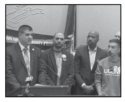
Advocating for increased funding to Connecticut State Colleges and Universities to prevent tuition increases.