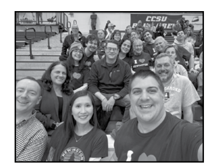
First-ever "Newington" Day at CCSU Men's Basketball game!