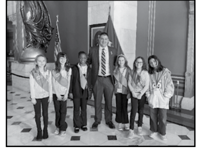
Girl Scouts from Newington and New Britain visit the Capitol!