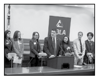
Hosted Newington High School students who are part of Future Business Leaders of America at the Leaislative Office Building!