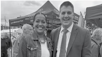
Enjoying New Britain's Little Poland Festival with Congresswoman Jahana Hayes