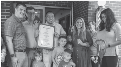
Celebrating the grand opening of Final Cut Sports Barber Shop with the Newington Chamber of Commerce