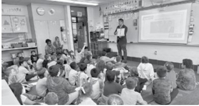
Teaching 3rd Graders from John Paterson Elementary School in Newington how a bill becomes a law

PSRST STD U.S. POSTAGE PAID HARTFORD, CT Permit No. 3937