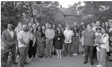
Meeting with New Britain's Racial Justice Coalition