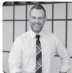
State Rep. Josh Elliott

Stay up-to-date by signing up for my e-blasts online at housedems.ct.gov/Elliott or scan the code with your phone