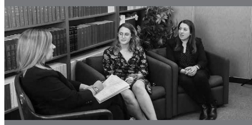
I interviewed my friends at the Yankee Institute regarding the issue of electronic tolling vs. bonding and interest payments to fund transportation in Connecticut — both the pros and cons of this very complicated issue. Check out my website for a link to watch online, or for air dates on Cox Cable and WPAA.

Phone: 860.240.8585 | e-mail: Liz.Linehan@cga.ct.gov Legislative Office Building, 300 Capitol Avenue, Hartford, CT 06106 www.housedems.ct.gov/Linehan