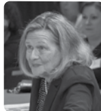
State Rep. Dillon

Stay up-to-date by signing up for my e-blasts online at housedems.ct.gov/dillon or scan the code with your phone