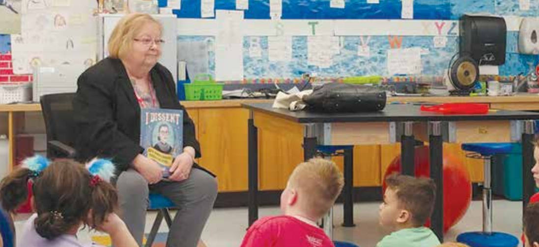
It was fun to read to students at South School in Windsor Locks!