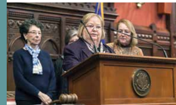
Had the chance to sit in as Speaker of the House during a technical session.

We have cleared the path for offshore wind energy generation in order to lead in green energy technology and help achieve Connecticut's renewable energy goals and looking at a positive economic impact and the creation of good-paying jobs. This will help achieve our energy consumption goal of 40% renewable energy by 2030 and will allow Connecticut to procure up to 2,000 megawatts of offshore wind power. The measure also includes provisions to protect and minimize impacts on the environment and fisheries.